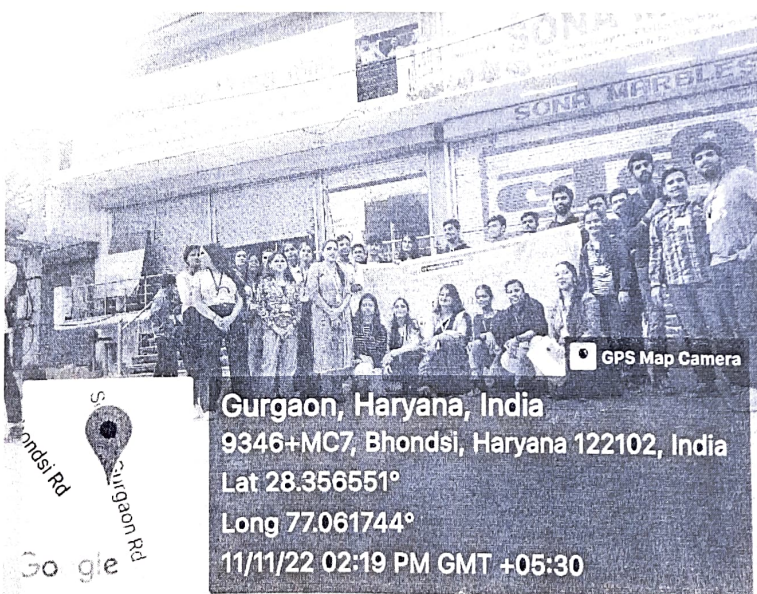
Image1- students of K.R. Mangalam University at Aakarshan Kaushal, Spark Minda Group, Bhondsi

Registrar K.R. Mangalam University Sohna Road, Gurugram (Haryana)