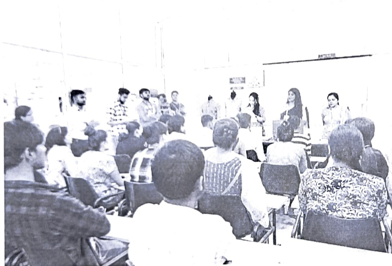
Image 3-Faculties of K.R. Mangalam along with student volunteers addressing NGO students and members.