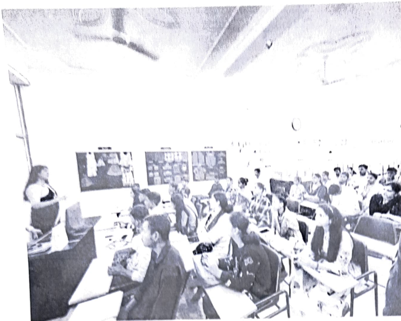
Image2- Students of NGO learning about mental health and stress management